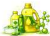
POLYMER & ENERGY Plasticizers & Biofuel Components