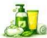
PERSONAL CARE Cosmetic & Surfactant Intermediates