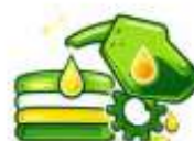
INDUSTRIAL Lubricants & Process Fluids