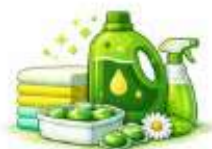
HOME CARE Detergent & Soap Feedstock